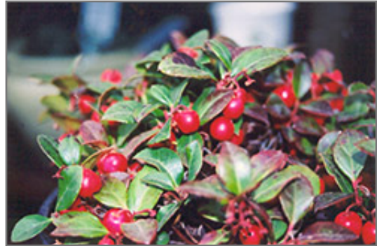
Creeping Wintergreen fruit

CUMBERLAND 201 Gray Rd (Route 100) Cumberland, ME 04021 1-800-348-8498 207-829-5619