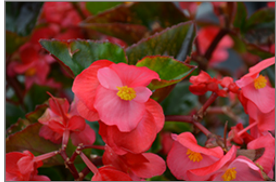
Big Rose Green Leaf Begonia flowers