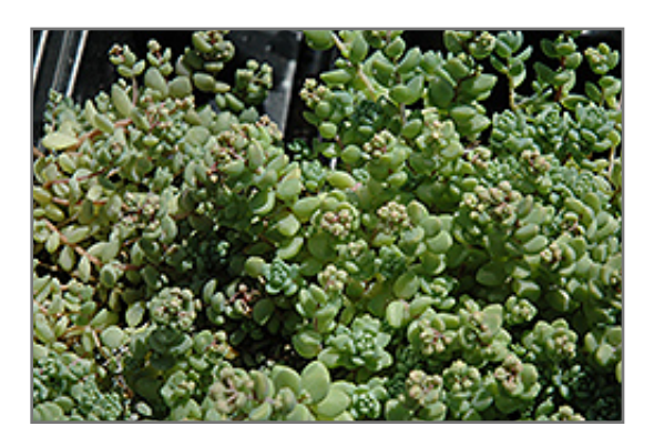
Corsican Stonecrop foliage

Corsican Stonecrop is recommended for the following landscape applications;