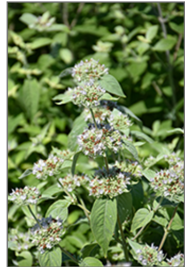
Short Toothed Mountain Mint flowers

This is a relatively low maintenance plant, and should be cut back in late fall in preparation for winter. It is a good choice for attracting bees and butterflies to your yard, but is not particularly attractive to deer who tend to leave it alone in favor of tastier treats. It has no significant negative characteristics.