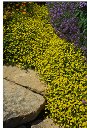
Gold Dust Mecardonia in bloom

Gold Dust Mecardonia is recommended for the following landscape applications;