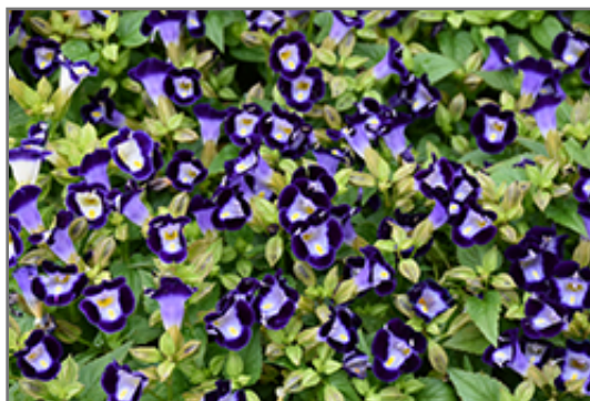
Catalina Midnight Blue Torenia flowers

This plant will require occasional maintenance and upkeep, and should not require much pruning, except when necessary, such as to remove dieback. It is a good choice for attracting bees and hummingbirds to your yard, but is not particularly attractive to deer who tend to leave it alone in favor of tastier treats. It has no significant negative characteristics.