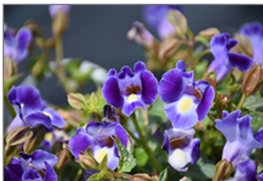
Catalina Midnight Blue Torenia flowers

BRUNSWICK 422 Bath Road Brunswick, ME 04011 1-800-339-8111 207-442-8111