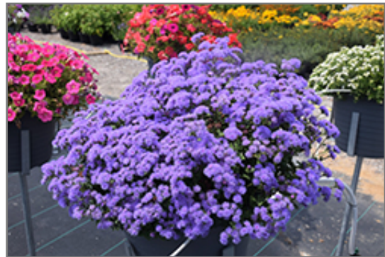
Artist Blue Flossflower in bloom

BRUNSWICK 422 Bath Road Brunswick, ME 04011 1-800-339-8111 207-442-8111