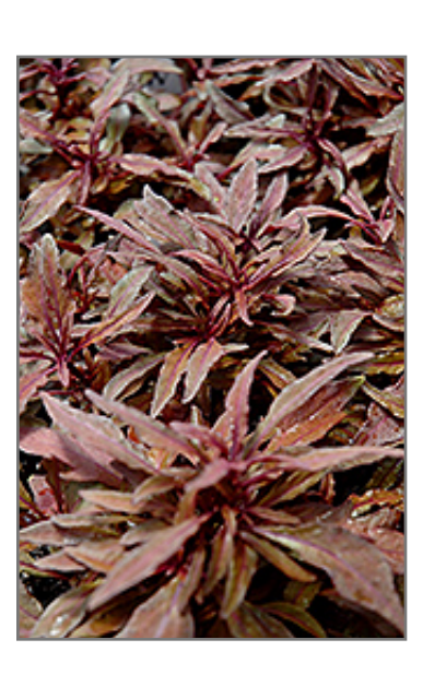
ColorBlaze Velvet Mocha Coleus foliage

CUMBERLAND 201 Gray Rd (Route 100) Cumberland, ME 04021 1-800-348-8498 207-829-5619