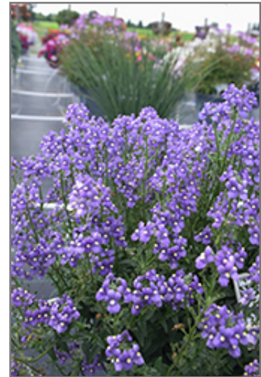
Bluebird Nemesia flowers