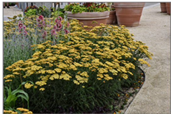
Terra Cotta Yarrow in bloom

BRUNSWICK 422 Bath Road Brunswick, ME 04011 1-800-339-8111 207-442-8111