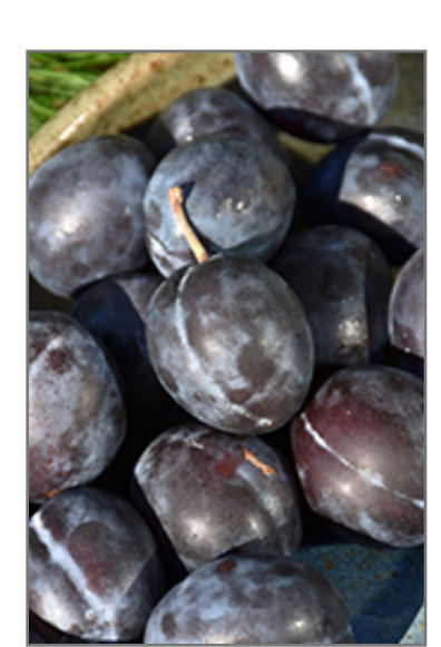
Stanley Plum fruit

This is a deciduous tree with a more or less rounded form. Its average texture blends into the landscape, but can be balanced by one or two finer or coarser trees or shrubs for an effective composition. This plant will require occasional maintenance and upkeep, and is best pruned in late winter once the threat of extreme cold has passed. Gardeners should be aware of the following characteristic(s) that may warrant special consideration;