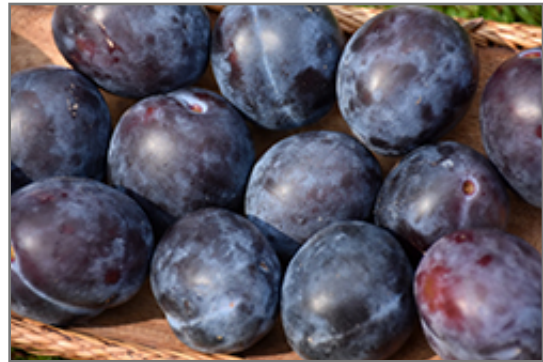
Mount Royal Plum fruit