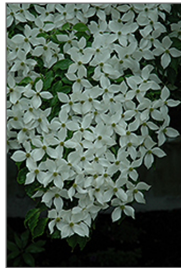
Lustgarten's Weeping Chinese Dogwood flowers

BRUNSWICK 422 Bath Road Brunswick, ME 04011 1-800-339-8111 207-442-8111