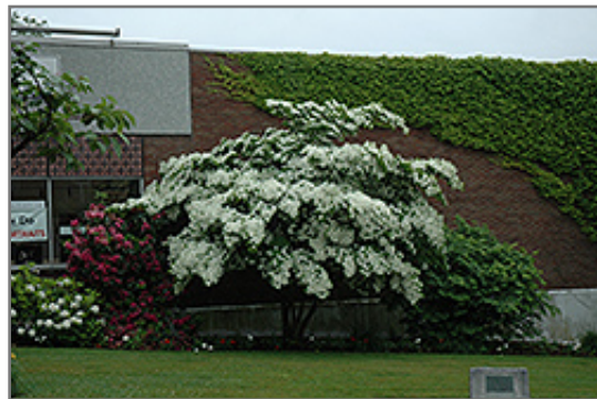
Lustgarten's Weeping Chinese Dogwood in bloom

This is a relatively low maintenance tree, and should only be pruned after flowering to avoid removing any of the current season's flowers. It is a good choice for attracting birds to your yard. It has no significant negative characteristics.