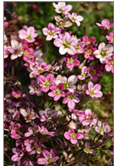
Purple Robe Saxifrage flowers

BRUNSWICK 422 Bath Road Brunswick, ME 04011 1-800-339-8111 207-442-8111