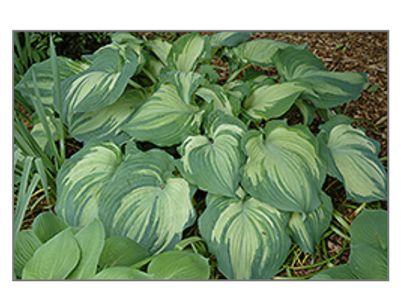
Guardian Angel Hosta

CUMBERLAND 201 Gray Rd (Route 100) Cumberland, ME 04021 1-800-348-8498 207-829-5619