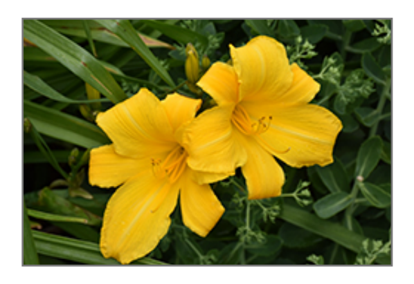
Buttered Popcorn Daylily flowers