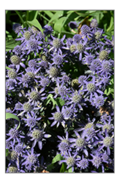
Blue Hobbit Sea Holly flowers

A most compact sea holly with unusual and show-stopping prickly steel-blue flowers with darker blue stems, thistle-like; tolerates hot dry sites; attractive to butterflies; pair up with softer textured plants, beautiful in dried arrangements