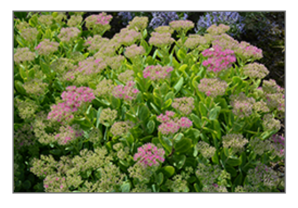
Neon Stonecrop in bloom