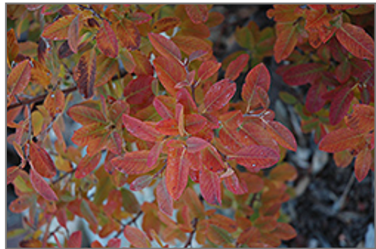
Rainbow Pillar Serviceberry in fall

BRUNSWICK 422 Bath Road Brunswick, ME 04011 1-800-339-8111 207-442-8111