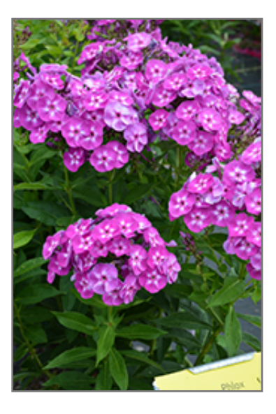
Laura Garden Phlox flowers

Laura Garden Phlox features bold fragrant conical lilac purple star-shaped flowers with white eyes at the ends of the stems from early summer to early fall. The flowers are excellent for cutting. Its narrow leaves remain green in color throughout the season.