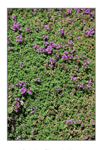
Creeping Thyme in bloom

This is a relatively low maintenance plant, and is best cleaned up in early spring before it resumes active growth for the season. Deer don't particularly care for this plant and will usually leave it alone in favor of tastier treats. It has no significant negative characteristics.