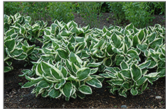
Minuteman Hosta

BRUNSWICK 422 Bath Road Brunswick, ME 04011 1-800-339-8111 207-442-8111