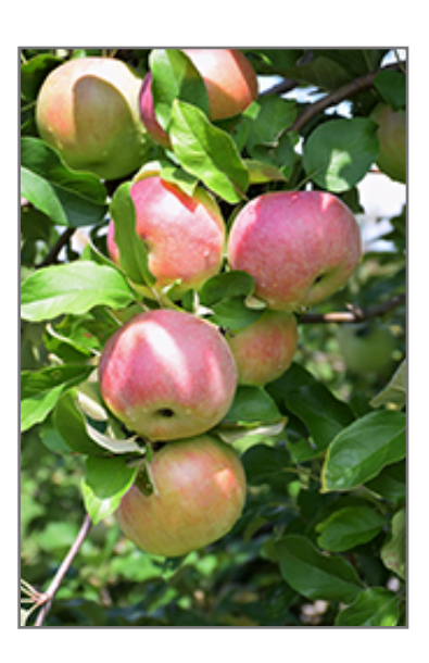
Northern Spy Apple fruit

CUMBERLAND 201 Gray Rd (Route 100) Cumberland, ME 04021 1-800-348-8498 207-829-5619