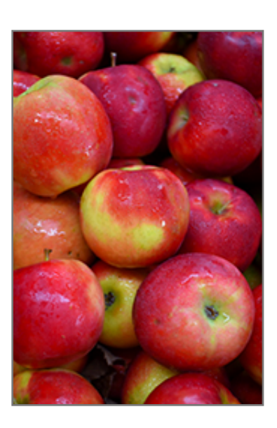
Crimson Crisp Apple fruit

CUMBERLAND 201 Gray Rd (Route 100) Cumberland, ME 04021 1-800-348-8498 207-829-5619