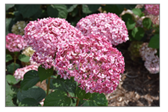
Invincibelle Spirit II Hydrangea flowers

89 Foreside Road Falmouth, ME 04105 1-800-244-3860 207-781-3860