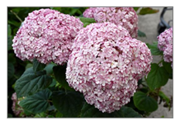
Invincibelle Spirit II Hydrangea flowers