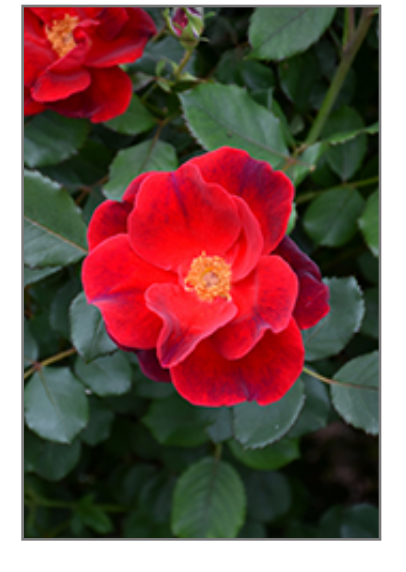
Miracle On The Hudson Rose flowers

201 Gray Rd (Route 100) Cumberland, ME 04021 1-800-348-8498 207-829-5619