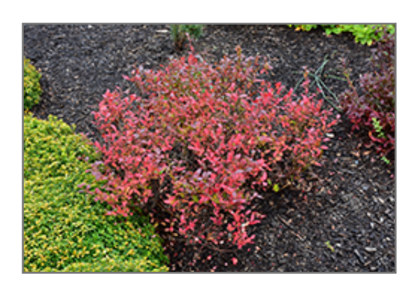
Lowbush Blueberry in fall

This is an open spreading deciduous shrub with a spreading, ground-hugging habit of growth. Its relatively fine texture sets it apart from other landscape plants with less refined foliage. This is a relatively low maintenance plant, and usually looks its best without pruning, although it will tolerate pruning. It is a good choice for attracting birds to your yard. It has no significant negative characteristics.