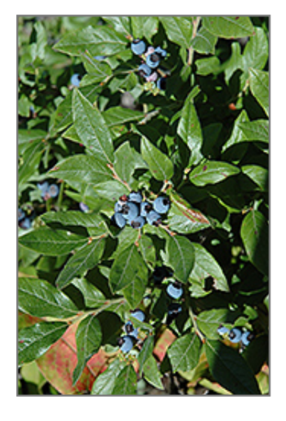
Lowbush Blueberry fruit

Lowbush Blueberry features dainty clusters of white bell-shaped flowers with shell pink overtones hanging below the branches in mid spring. It has dark green deciduous foliage. The oval leaves turn an outstanding scarlet in the fall. It features an abundance of magnificent blue berries in mid summer.