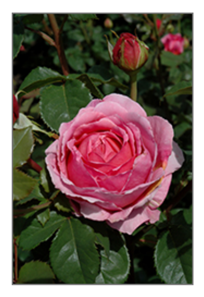
Princess Alexandra Of Kent Rose flowers