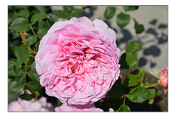
Princess Alexandra Of Kent Rose flowers

89 Foreside Road Falmouth, ME 04105 1-800-244-3860 207-781-3860