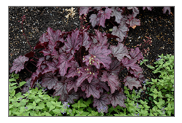
Spellbound Coral Bells

This is a relatively low maintenance plant, and should be cut back in late fall in preparation for winter. It is a good choice for attracting hummingbirds to your yard. It has no significant negative characteristics.