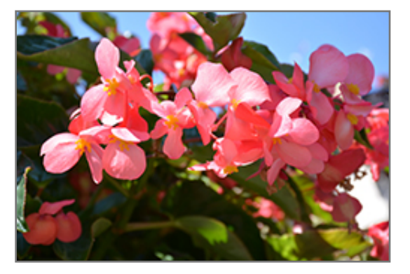
Dragon Wing Pink Begonia flowers

This is a high maintenance plant that will require regular care and upkeep, and usually looks its best without pruning, although it will tolerate pruning. Deer don't particularly care for this plant and will usually leave it alone in favor of tastier treats. Gardeners should be aware of the following characteristic(s) that may warrant special consideration;