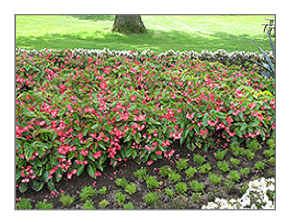
Dragon Wing Pink Begonia in bloom

201 Gray Rd (Route 100) Cumberland, ME 04021 1-800-348-8498 207-829-5619