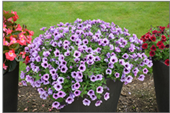
Supertunia Bordeaux Petunia in bloom

Supertunia Bordeaux Petunia is a fine choice for the garden, but it is also a good selection for planting in outdoor containers and hanging baskets. Because of its trailing habit of growth, it is ideally suited for use as a 'spiller' in the 'spiller-thriller-filler' container combination; plant it near the edges where it can spill gracefully over the pot. Note that when growing plants in outdoor containers and baskets, they may require more frequent waterings than they would in the yard or garden.