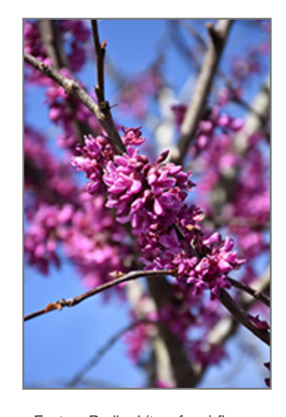
Eastern Redbud (tree form) flowers

CUMBERLAND 201 Gray Rd (Route 100) Cumberland, ME 04021 1-800-348-8498 207-829-5619