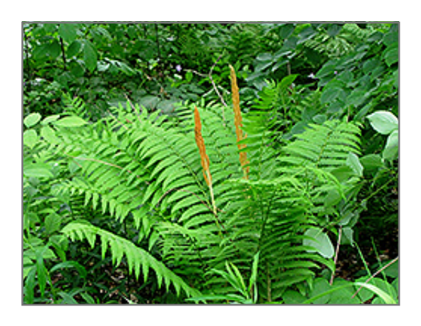
Cinnamon Fern in bloom

Cinnamon Fern is recommended for the following landscape applications;