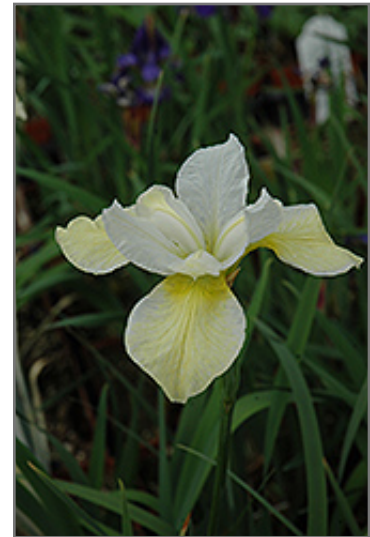
Butter And Sugar Siberian Iris flowers

Butter And Sugar Siberian Iris will grow to be about 22 inches tall at maturity, with a spread of 24 inches. When grown in masses or used as a bedding plant, individual plants should be spaced approximately 18 inches apart. It grows at a medium rate, and under ideal conditions can be expected to live for approximately 10 years. As an herbaceous perennial, this plant will usually die back to the crown each winter, and will regrow from the base each spring. Be careful not to disturb the crown in late winter when it may not be readily seen!