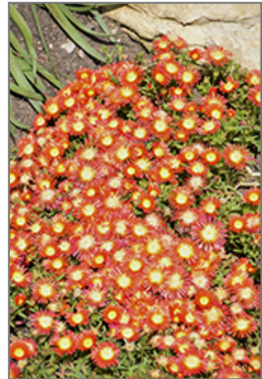
Delmara Red Ice Plant

This is a relatively low maintenance plant, and is best cleaned up in early spring before it resumes active growth for the season. It is a good choice for attracting bees and butterflies to your yard. It has no significant negative characteristics.