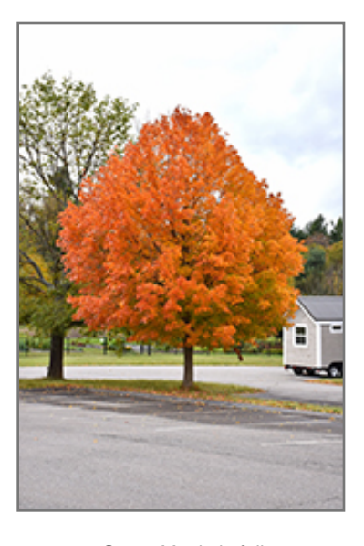
Sugar Maple in fall