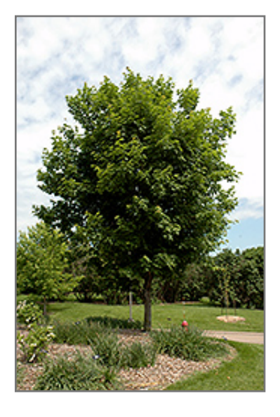
Sugar Maple

This tree should only be grown in full sunlight. It prefers to grow in average to moist conditions, and shouldn't be allowed to dry out. It is not particular as to soil pH, but grows best in rich soils. It is somewhat tolerant of urban pollution. This species is native to parts of North America.