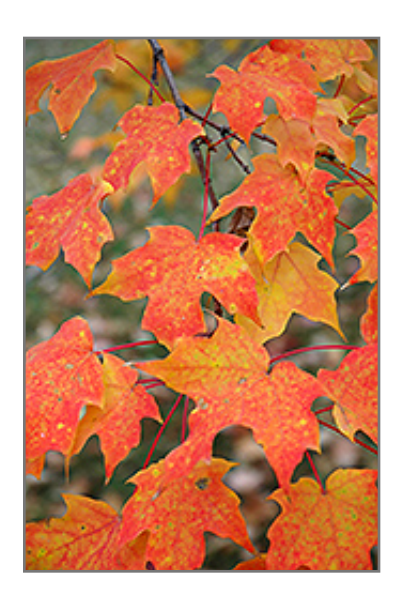
Sugar Maple in fall