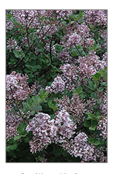
Dwarf Korean Lilac flowers

Dwarf Korean Lilac is recommended for the following landscape applications;