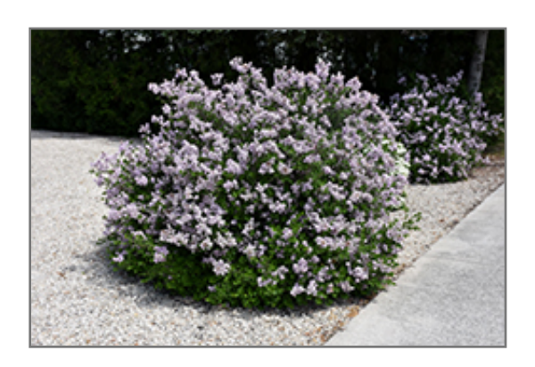
Dwarf Korean Lilac in bloom