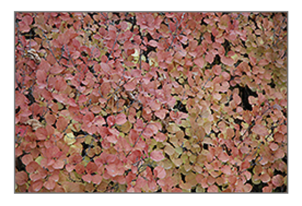
Dwarf Korean Lilac in fall

This shrub should only be grown in full sunlight. It is very adaptable to both dry and moist locations, and should do just fine under average home landscape conditions. It is not particular as to soil type or pH. It is highly tolerant of urban pollution and will even thrive in inner city environments. This is a selected variety of a species not originally from North America.