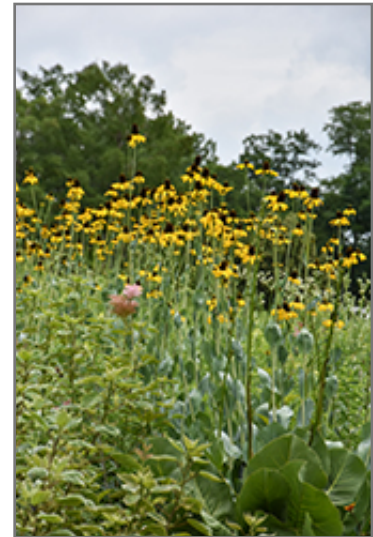
Giant Coneflower in bloom

Giant Coneflower is recommended for the following landscape applications;