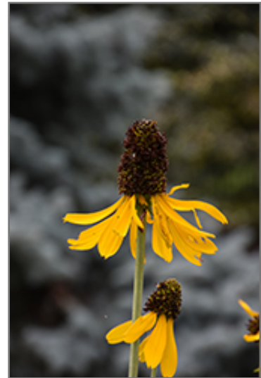
Giant Coneflower flowers

* This is a 'special order' plant - contact store for details