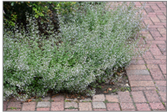
Blue Cloud Dwarf Calamint in bloom

Blue Cloud Dwarf Calamint is recommended for the following landscape applications;