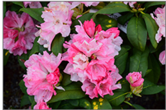
Yaku Prince Rhododendron flowers

Yaku Prince Rhododendron will grow to be about 3 feet tall at maturity, with a spread of 4 feet. It tends to be a little leggy, with a typical clearance of 1 foot from the ground. It grows at a slow rate, and under ideal conditions can be expected to live for 40 years or more.