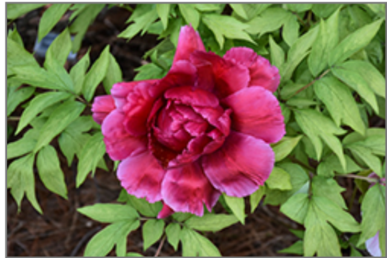
Red Tree Peony flowers

Red Tree Peony will grow to be about 5 feet tall at maturity, with a spread of 5 feet. It has a low canopy, and is suitable for planting under power lines. It grows at a slow rate, and under ideal conditions can be expected to live for approximately 20 years.