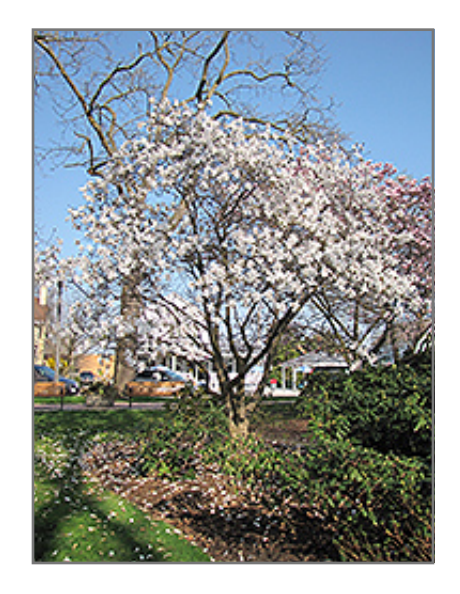
Waterlily Magnolia in bloom