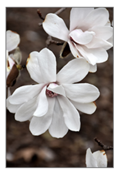
Merrill Magnolia flowers