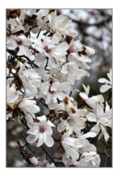
Merrill Magnolia flowers

This tree does best in full sun to partial shade. It requires an evenly moist well-drained soil for optimal growth, but will die in standing water. It is not particular as to soil type, but has a definite preference for acidic soils. It is quite intolerant of urban pollution, therefore inner city or urban streetside plantings are best avoided. Consider applying a thick mulch around the root zone in winter to protect it in exposed locations or colder microclimates. This particular variety is an interspecific hybrid.