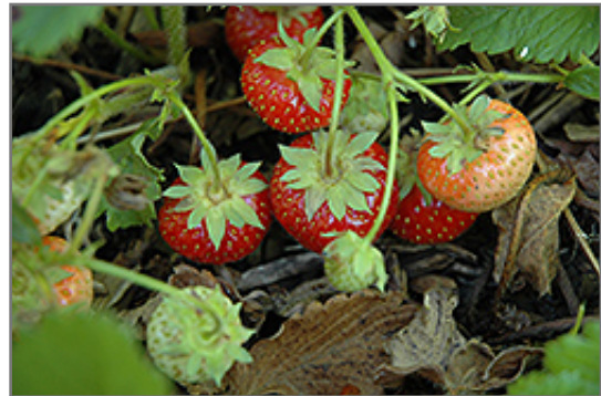
Common Wild Strawberry

Common Wild Strawberry features dainty white cup-shaped flowers with yellow eyes along the stems from late spring to early summer. Its attractive tomentose round compound leaves remain green in color throughout the season. It features an abundance of magnificent cherry red berries from late spring to late summer.