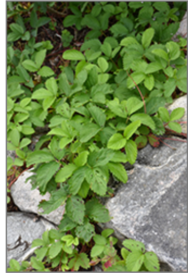
Common Wild Strawberry

Common Wild Strawberry is a good choice for the edible garden, but it is also well-suited for use in outdoor pots and containers. Because of its spreading habit of growth, it is ideally suited for use as a 'spiller' in the 'spiller-thriller-filler' container combination; plant it near the edges where it can spill gracefully over the pot. Note that when growing plants in outdoor containers and baskets, they may require more frequent waterings than they would in the yard or garden.