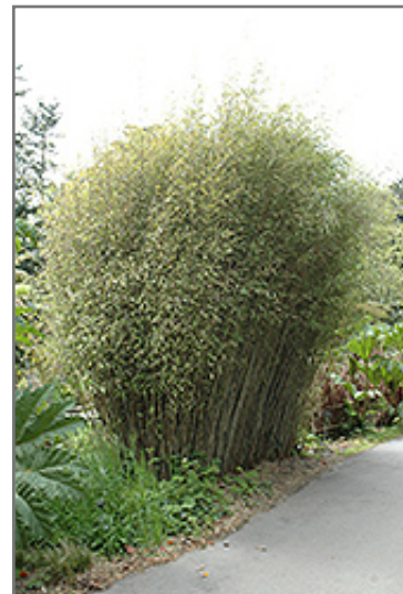
Blue Fountain Bamboo