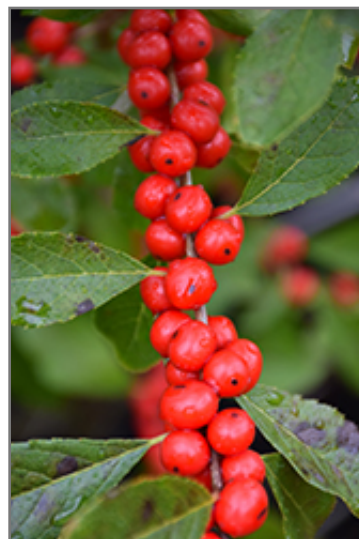
Red Sprite Winterberry fruit

Red Sprite Winterberry is recommended for the following landscape applications;