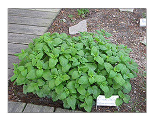
Lemon Balm