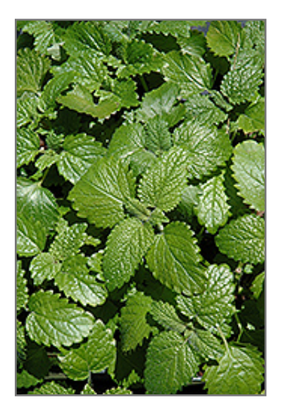
Lemon Balm foliage

Lemon Balm's attractive fragrant pointy leaves emerge light green in spring, turning green in color throughout the season on a plant with an upright spreading habit of growth. It features dainty lightly-scented white flowers along the stems in late summer.