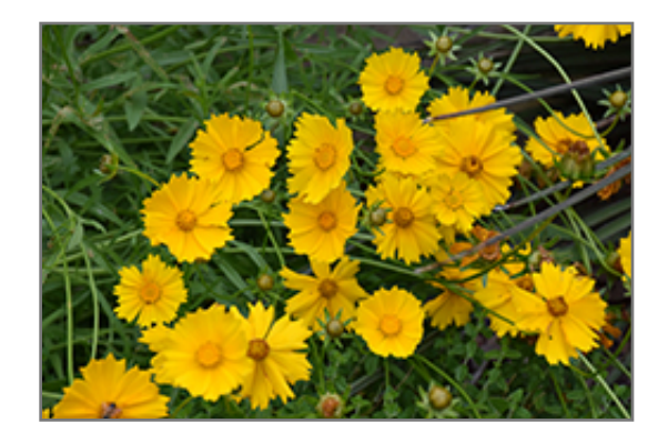
Lanceleaf Tickseed flowers

All this variety needs is well drained soil and lots of sunshine and it will bloom profusely all summer long; a more open and airy form and a wildflower look that blends well in a cottage style garden; when positioning remember flowers follow the sun