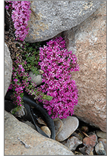
Pink Chintz Creeping Thyme in bloom

This plant should only be grown in full sunlight. It prefers to grow in average to dry locations, and dislikes excessive moisture. It is not particular as to soil type or pH. It is highly tolerant of urban pollution and will even thrive in inner city environments. Consider covering it with a thick layer of mulch in winter to protect it in exposed locations or colder microclimates. This is a selected variety of a species not originally from North America. It can be propagated by division; however, as a cultivated variety, be aware that it may be subject to certain restrictions or prohibitions on propagation.