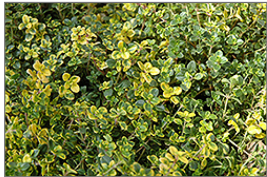
Doone Valley Thyme

BRUNSWICK 422 Bath Road Brunswick, ME 04011 1-800-339-8111 207-442-8111